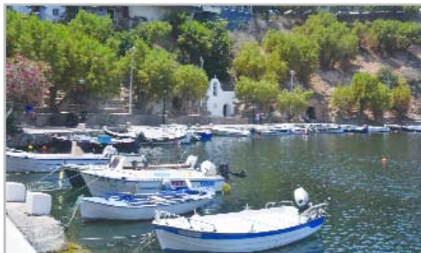
An enchanting setting